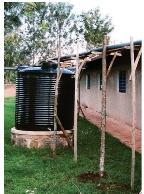
One of the TELD buildings, with a plastic water tank.